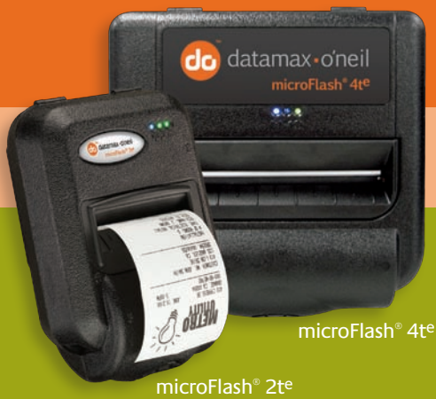
microFlash® 4t e